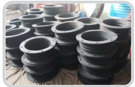
MULTIPLE ARC RUBBER EXPANSION BELLOW