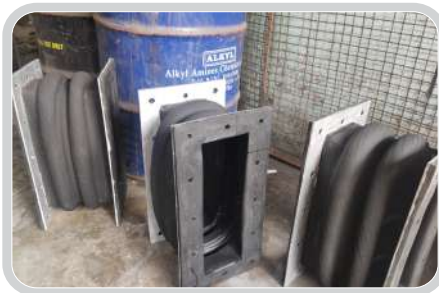
RECTANGULAR EXPANSION JOINT