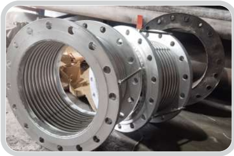
SS EXPANSION JOINTS