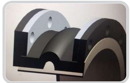
WEAR SLEEVE EXPANSION JOINT