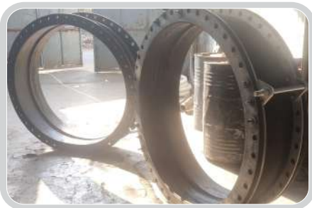
RUBBER EXPANSION JOINT SPLIT FLANGE