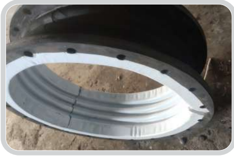
PTFE LINING RUBBER BELLOW