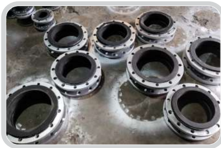
RUBBER EXPANSION JOINT ROTABLE FLANGE