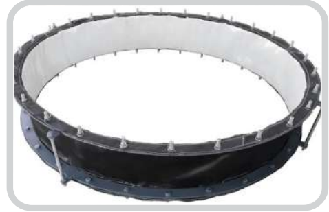
FABRIC EXPANSION JOINTS