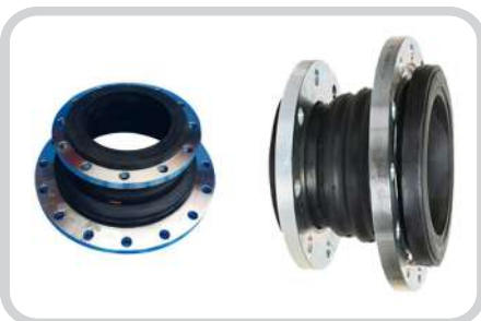
TAPER/REDUCER EXPANSION JOINT