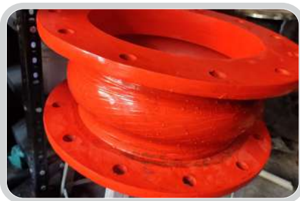
SILICON EXPANSION JOINT