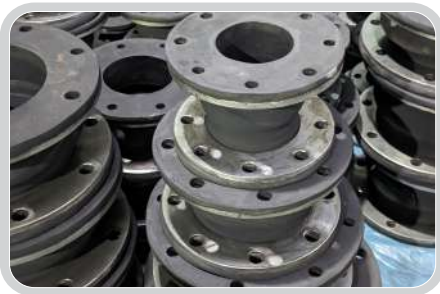
RUBBER EXPANSION JOINT FIXED FLANGE